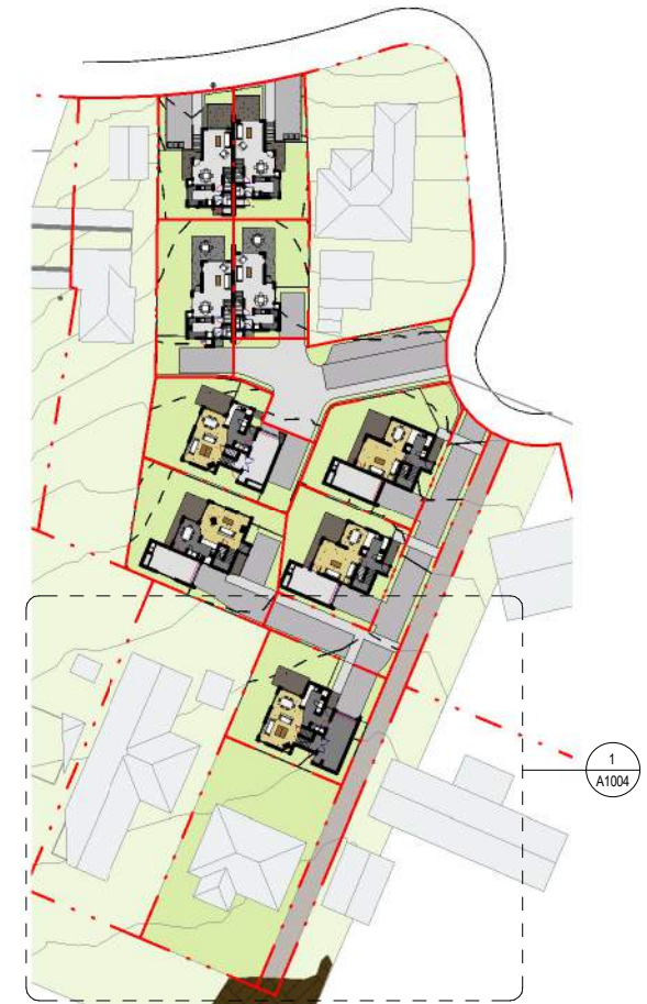
2 SITE PLAN KEY 3 A1 SCALE 1 : 500