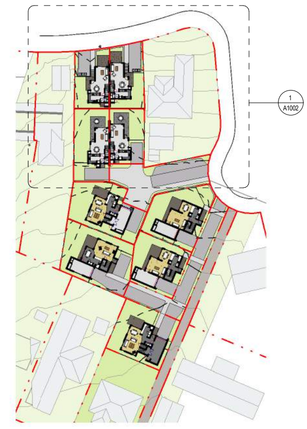
2 SITE PLAN KEY 1 A1 SCALE 1 : 500