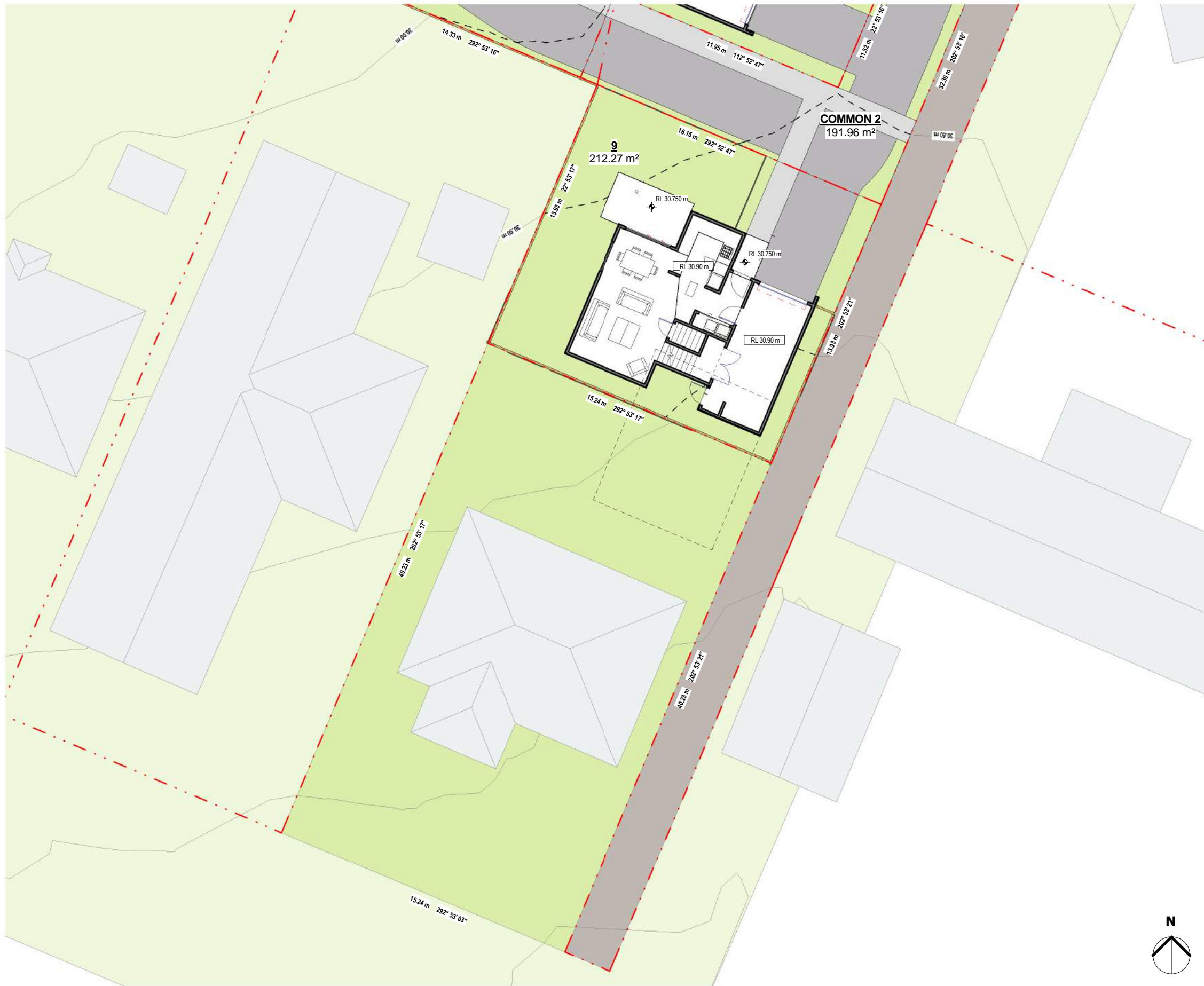
1 SITE PLAN 3 A1 SCALE 1 : 100